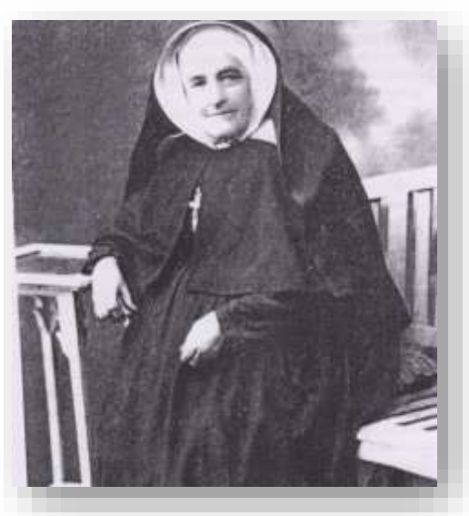
Les Sœurs SJA de la Province Israël - Palestine